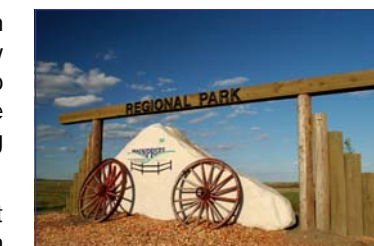
Mainprize Regional Park Gate Entrance

Mainprize Regional Park & Golf Course is just a short drive from Midale (15 km). This park offers camping, cabin rentals, boat rentals, playgrounds, ball diamonds and a 18 hole golf course!