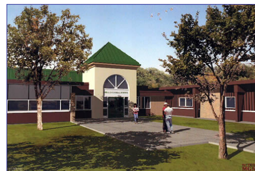
Midale Central School 610 College Avenue

There is plenty of oil activity in the Midale region and oil drilling companies are constantly looking for qualified rig hands. Midale is also close enough to Estevan and Weyburn, which gives residents the opportunity to commute to work but still enjoy living in a small-town! A few of the major employers in the Midale area are Brady Oilfield Services (Halbrite), Carson Welding & Maintenance (Halbrite), Midale Central School, Mainprize Manor & Health Centre and Mainprize Regional Park & Golf Course.