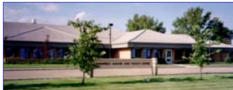
Mainprize Manor 206 South St

Mainprize Manor & Health Services — this facility provides the following services to its residents and members of the community: long term care, handivan, day respite, doctor clinics, lab services & outpatient services.