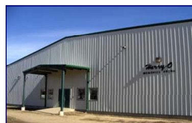
Harry-O Memorial Arena